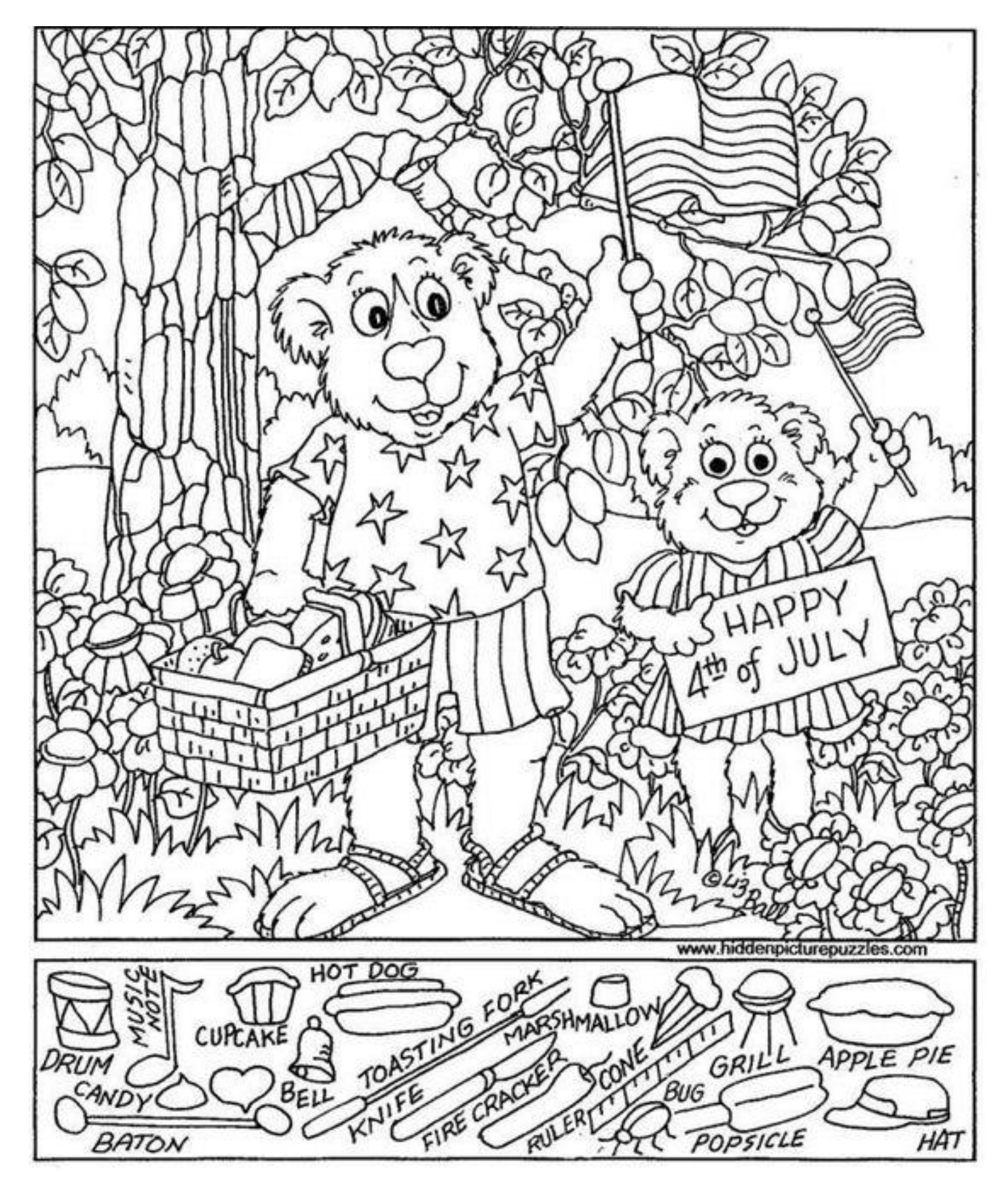
How many can you find?